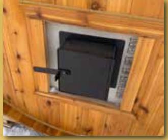
OUTSIDE LOADING ACCESS