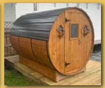
HANDCRAFTED IN THE USA